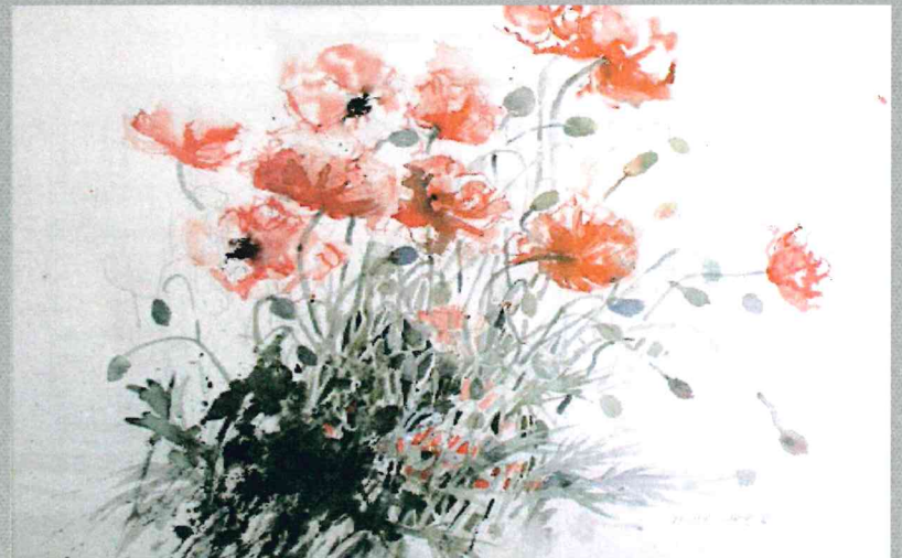
Molly Lamb Bobak, Poppies II, 1990.